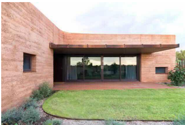
The characteristics of rammed earth wall (overseas photographing reference)