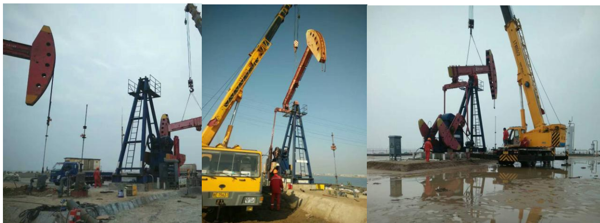
Dongying - offshore oil field drilling platform solidified (sand soil; lime + cement soil formula)